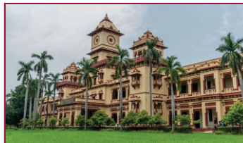
Banaras Hindu University