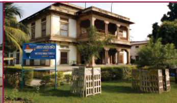
Bharat Mata Mandir