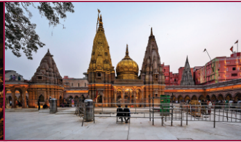
Kashi Vishwanath Dham