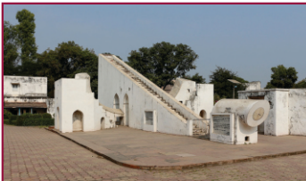
Vedhshala, Jantar Mantar